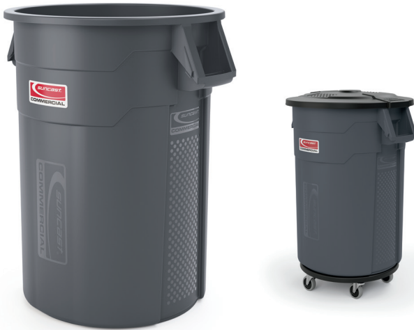
TCU55 model shown